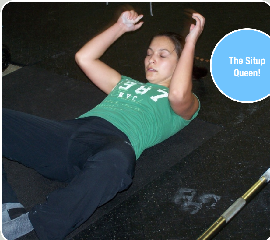
The Situp Queen!